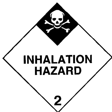
Figure 1—Inhalation hazard label