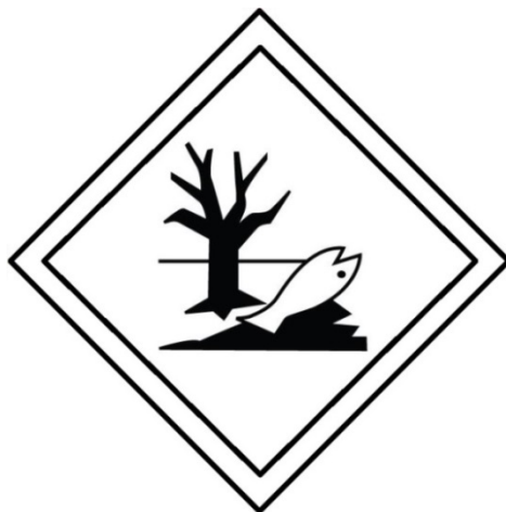
Figure 3—Marine pollutant mark