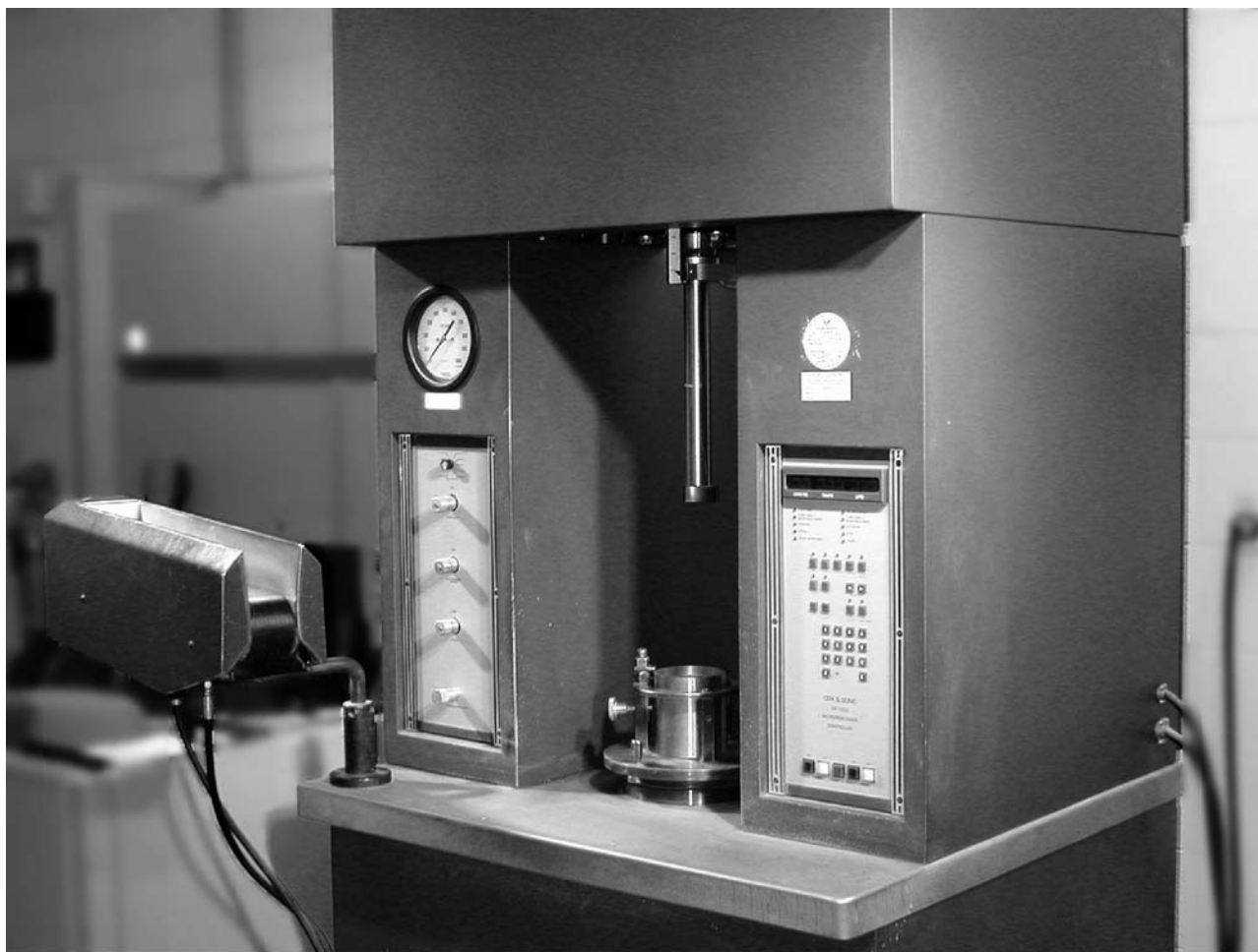
FIG. 2 Compactor with Sample Feed Trough

5.14 Standard Metal Specimen , 101.6 mm [4.0 in.] in outside diameter by 152.2 mm [6.0 in.] high as shown in Fig. 11.