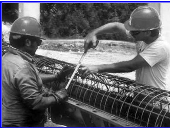
Fig. 7-2. Pole fabrication inspection

Spun-Cast Pole Tolerances: Product tolerances (see Fig. 7-2) are to be limited to the following: