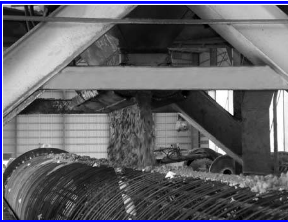
Fig. 7-3. Placing concrete

To ensure that proper methods for all phases of production are being followed and the finished product complies with the specified requirements, a regular inspection program that inspects all aspects of production are to be provided. Each pole is to be uniquely marked and inspected per the procedure and a detailed written inspection report on record.