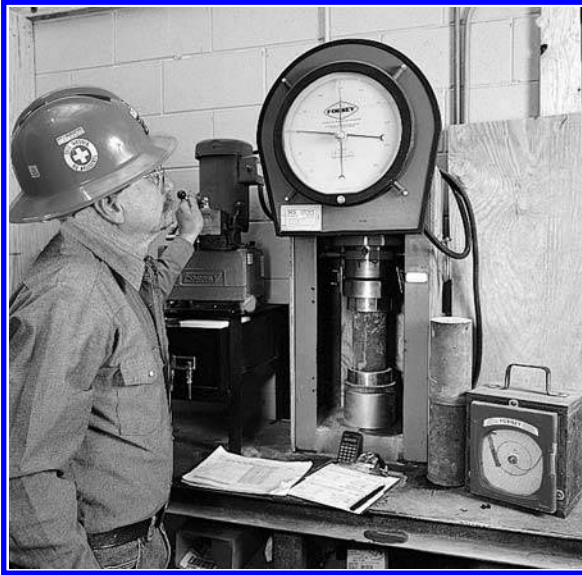
Fig. 7-4. QC cylinder break

Source: Photograph courtesy of Valmont Newmark. Reproduced with permission.